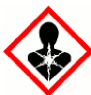
SENSITISER, CARCINOGEN, MUTAGEN OR TERATOGEN

Material safety data sheets accompany COSHH assessments, they explain the safe, storage, disposal and emergency procedures for their use.